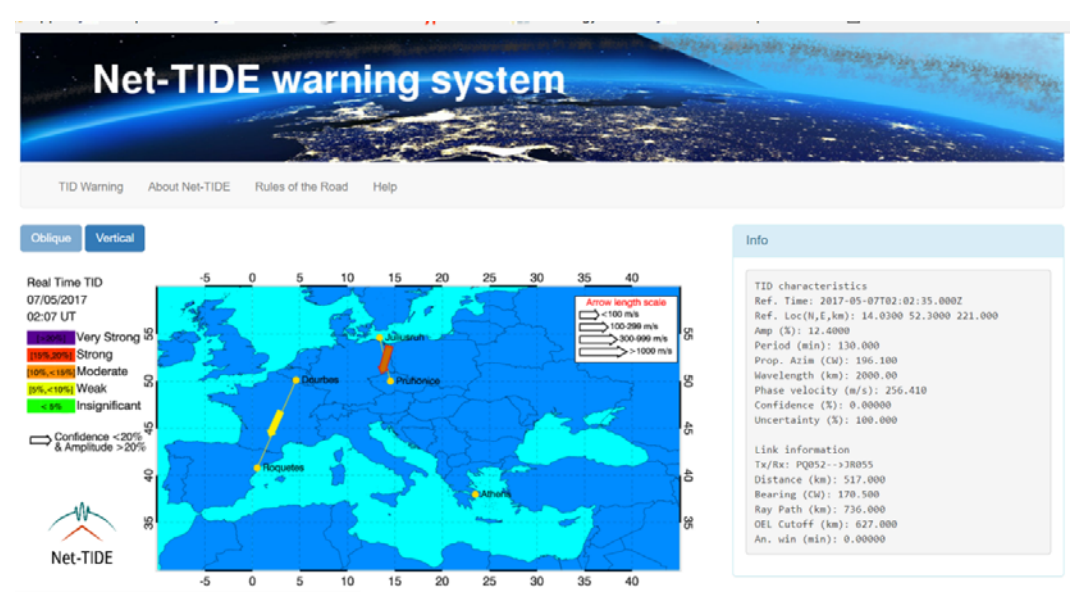
Figure 2: TID Warning system report for May 7, 2017 02:07 UT indicating presence of a large-scale moderate-strength TID travelling SSW at 250 m/s phase velocity.

The 2015-2017 triennium is marked by increased interest to emerging technologies for detection and evaluation of traveling ionospheric disturbances (TID) that leverage recently developed analysis techniques for data from coordinated oblique-incidence sounding between DPS4D ionosondes. A pilot operations Network for TID Evaluation (Net-TIDE) started in 2016. https://sites.google.com/site/spsionosphere/. TID warning service established Α is http://tid.space.noa.gr/ that publishes alerts of TID events of defferent levels of severity.